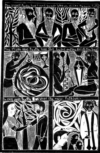
The ancient people 1973