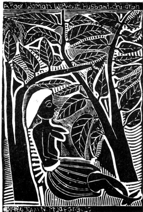
A poor woman 1986